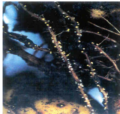
Figure 1. Potato cyst nematodes Globodera spp on infected root system and potato tuber.

A recent survey in Rayak area in the central Bekaa Valley revealed that 17% of surveyed field were infested with G. rostochiensis (Ibrahim, et al. , 2000). This study was the first to report the presence of PCN in Lebanon, establishing its origin and distribution throughout the potato growing areas as an important pest (Fig.1). In Lebanon, no extensive and systematic surveys have been done on plant parasitic nematodes for the last 20 years. In a survey on plant parasitic nematodes conducted during the early 1970s (Taylor, et al. , 1972), PCN was not reported in Lebanon. Their survey concentrated on the coastal areas, whereas the present survey was conducted in the main areas of agricultural production throughout the country. The distribution of Globodera rostochiensis and G. pallida is worldwide and they rarely occur alone but more often in combination in one field (Ibrahim et al. , 2001; Minnis et al. , 2002).