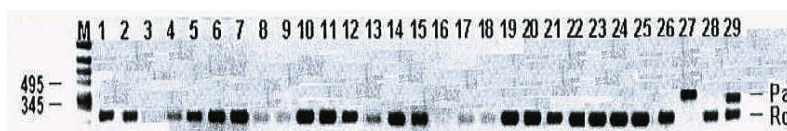
Figure 4. PCR Differentiation of potato cyst nematodes (PCN) Globodera rostochiensis (Ro) and G. pallida (Pa). Lanes 1-26 from soil samples that contained PCN, Lanes 27-29 known species of PCN (control), M: molecular marker ( \Phi X174 DNA Hinc II).

The species of PCN were determined in each sample that was found to contain eggs. One hundred and forty eight population identifications were made by PCR techniques. The results showed that all the samples tested (72.5%) were infested with G. rostochiensis (Fig. 4) No G. pallida population was detected by PCR techniques among the tested samples. The PCR amplification was successful using crude DNA of single or bulk nematodes as templates. In combination, the species-specific primers of G. pallida (PITSp4) and G. rostochiensis (PITSr3) and the ITS5 primer readily differentiated between all the populations tested from Lebanon and from known British populations of G. pallida and G. rostochiensis (Fig. 5). G. rostochiensis had a PCR product of 265 bp using PITSr3 primer, whereas G. pallida showed 434 bp with PITSp4 primer. Some populations (7% of the total sample tested (11 samples)) failed to amplify with PCR.